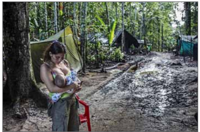
Winner of the 2017 Canon Female Photojournalist Award