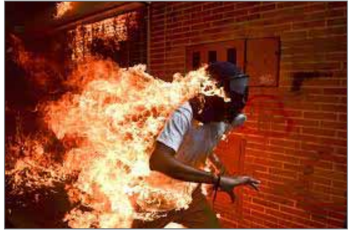
© Ronaldo Schemidt - World Press Photo of the Year

The reference competition for photojournalism around the world, with Perpignan as the ultimate venue for the exhibition.